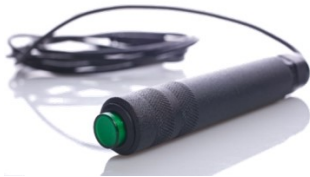
Patient Response Unit