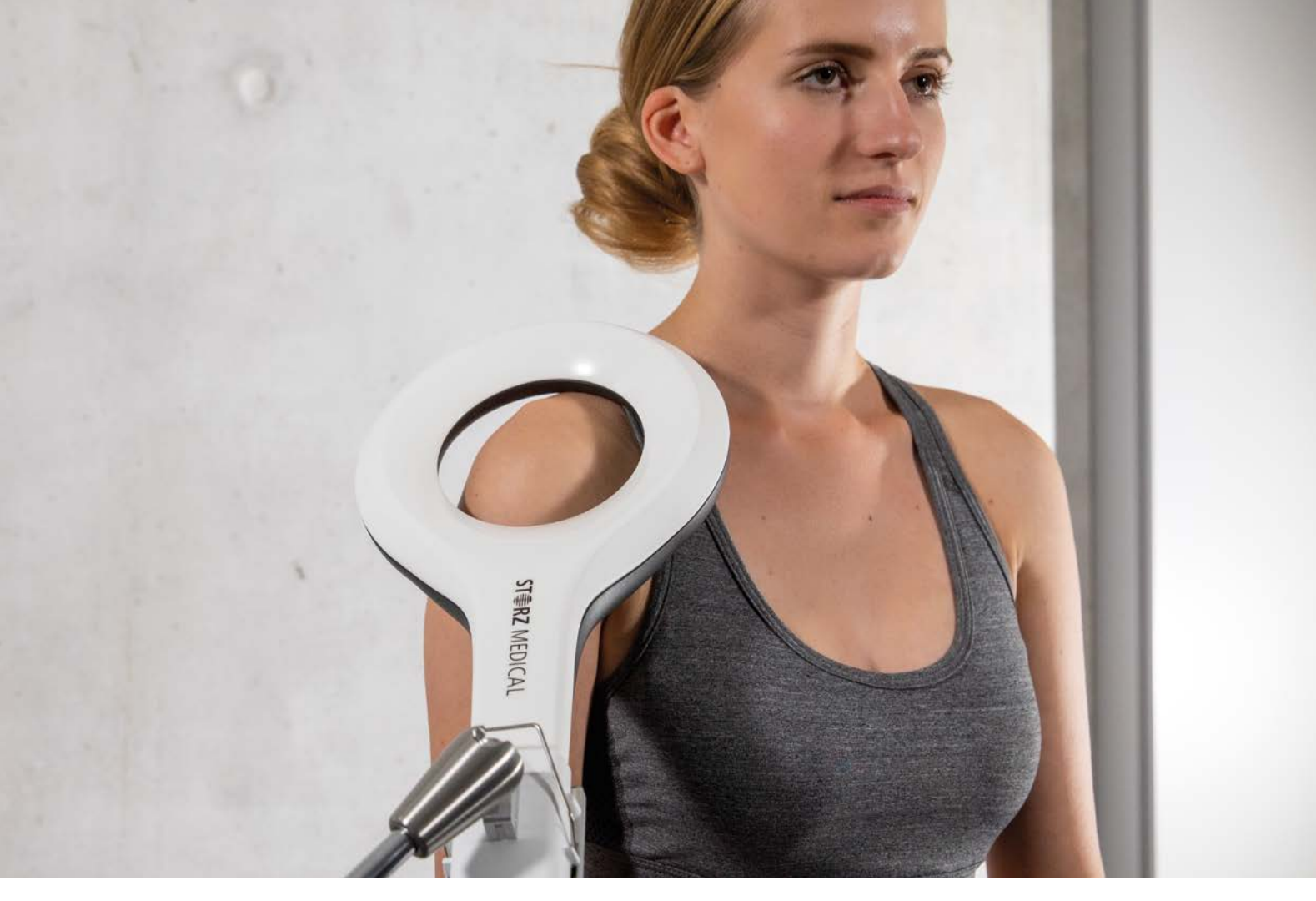
Static treatment of shoulder with holding arm

Extracorporeal Magnetotransduction Therapy (EMTT<sup>®</sup>) with the MAGNETOLITH<sup>®</sup> opens up new possibilities in regeneration and rehabilitation. The areas of application include diseases of the musculoskeletal system such as lower back pain, tendinopathies of the rotator cuff or achilles tendon.