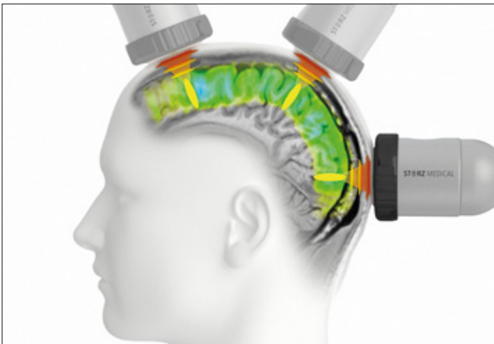
Fig. 1 Noninvasive TPS-technology can administer stimulation-pulses on the surface and in deeper structures of the brain.

Regenerative effects of transcranial pulse stimulation (TPS) through mechanotransduction of shock waves have already been shown in various disorders. The method has a CE certification for use in Alzheimer's disease. In this case, the TPS - procedure was applied off-label in a 42-year-old woman with complete loss of smell and taste a part of a Long-Covid-Syndrome [post Covid-19 infection - Delta type ]. The loss of taste and anosmia persisted for more than a year before treatment.